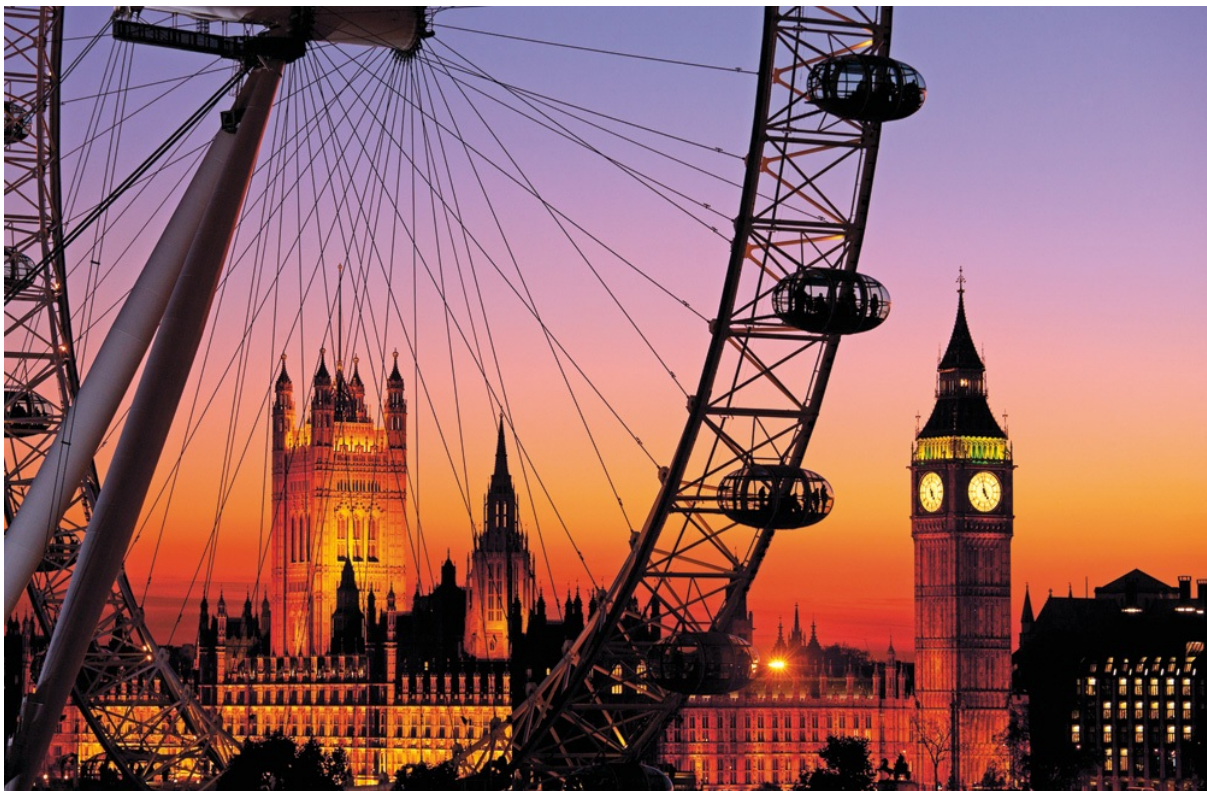
Big Ben ( Click here ), Houses of Parliament ( Click here ) and the London Eye ( Click here )

Edinburgh Castle, Buckingham Palace, Stonehenge, Manchester United, The Beatles – Britain does icons like no other place on earth, and travel here is a fascinating mix of famous names and hidden gems.